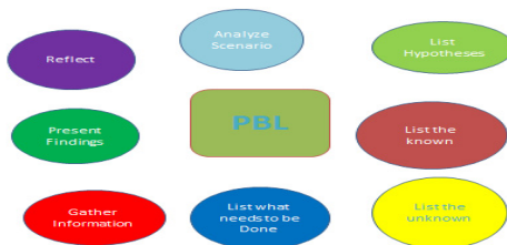
Figure 1. The process of learning (PBL)

In traditional approaches to learning based on traditional way, data is provided first in traditional way of learning, but in PBL problems are presented to the students’ to solve the problem. Figure 1 represents the process of learning and showing how each step is inter-connected to each other.